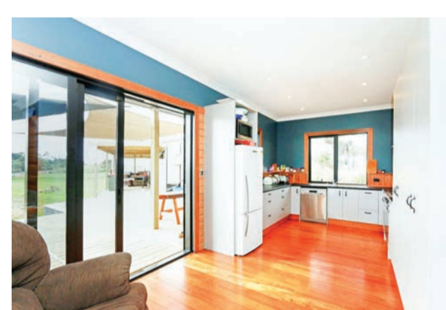
Optimal energy conservation is a feature of this outstanding property.

Don't miss the Open Home on Sunday April 14 at 2pm.