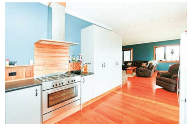
The well-equipped kitchen has a gas hob/electricity stove and a modern automatic dish washer.

Just recently arrived on the market is an exceptional property at 6190 South Road, Pungarehu. It is easy to find, as it is located opposite the Pungarehu Golf Club, about 40 minutes south of New Plymouth. The property is owned by respected builder Phill Brophy of HCL Builders and is marketed by Michelle Hofmans of First National.