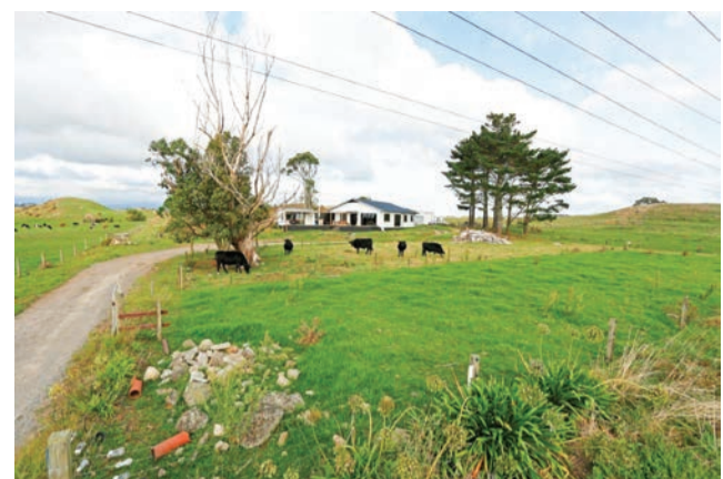
The four and a half acre property is located at 6190 South Road, Pungarehu.