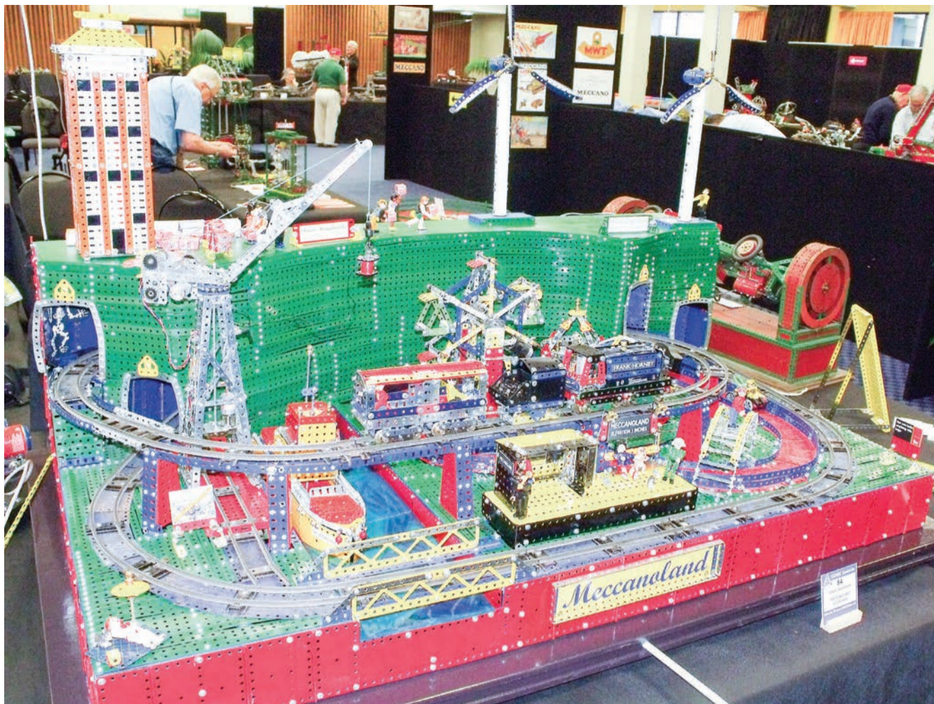
A lot of the angle girder framing of the rollercoaster went into the framework of my diorama model 'Meccanoland' This photograph was taken at our 2011 Palmerston North convention. The model was finished for this gathering having been started many years before. This is the only time this model has been shown and it will be in Inglewood with a few more modules added since this photo.

In this way, a boy could have a locomotive one day, a truck the next, maybe a crane at the weekend and an aeroplane after School