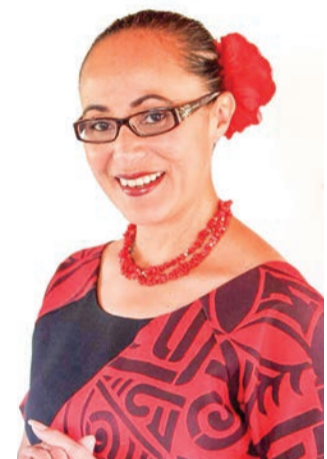
Associate Health Minister Jenny Salesa.

“I am also focussed on developing an action plan to achieve our Smokefree 2025 goal. It is my intention that a full suite of possible actions is considered, and that a draft action plan will be available for public consultation by the end of this year.”