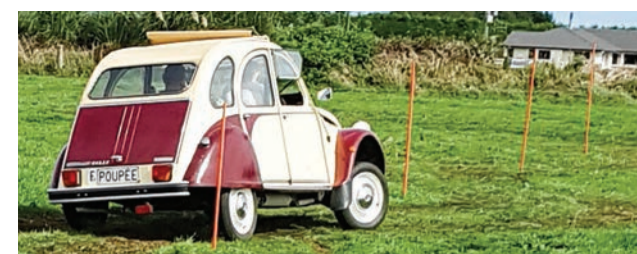
One of the 15 entrants.