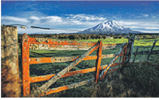
Red Gate