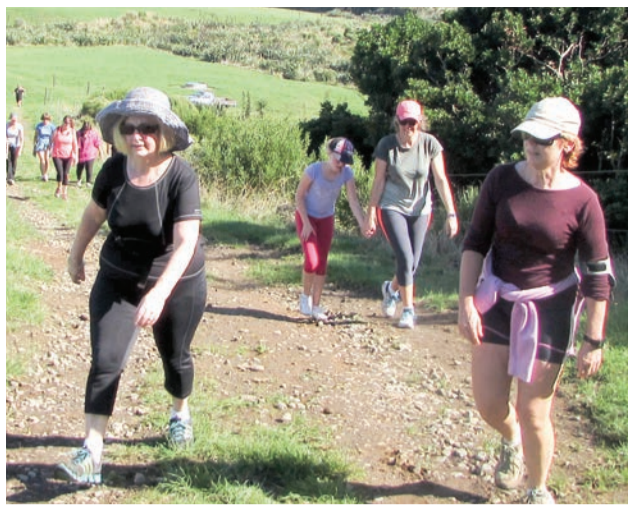
Join the Pihama Walk for Cancer on April 17.