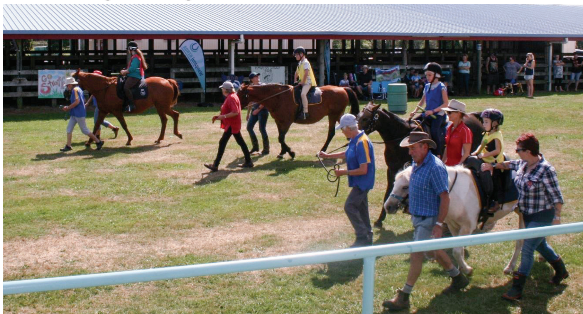
Riding for the Disabled (RDA) at the Hawera Showgrounds.

On Sunday March 24 the Regional Games for the Riding for the Disabled (RDA) central area were held in brilliant sunshine at the RDA grounds in Hawera, coordinated this year by the Wanganui