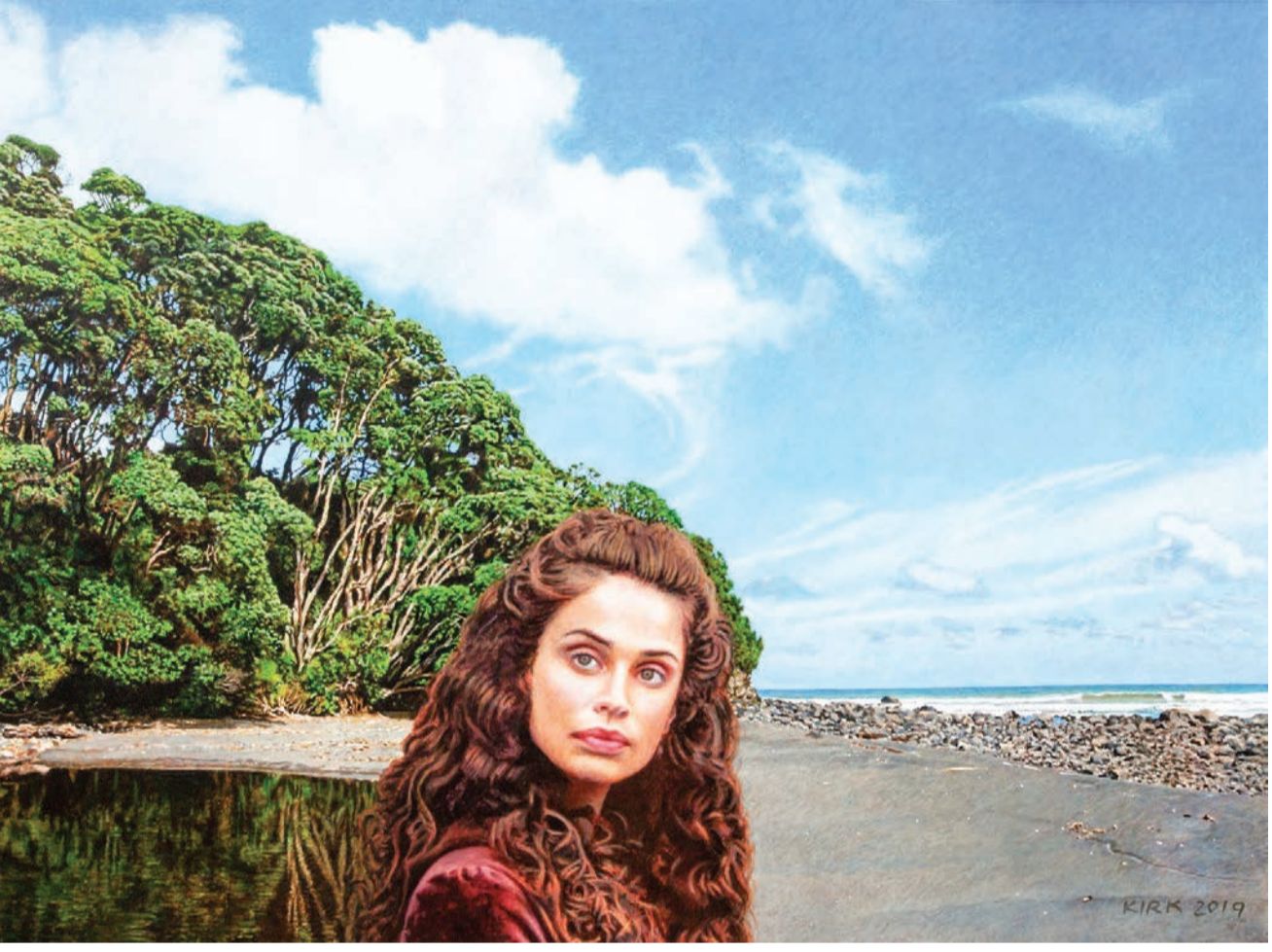
“Elizabeth at Pitone Road Beach” is the third painting that I’ve done of characters from the TV series Poldark. They seem to spend a lot of time down at the beach in the series so I thought that I would relocate two of them, Elizabeth and Demelza to two New Zealand beaches, one in Taranaki and one in Auckland.

Both paintings can be seen in the foyer of Kingsroy Electric in Devon Street New Plymouth. (Next to the TSB Showplace).