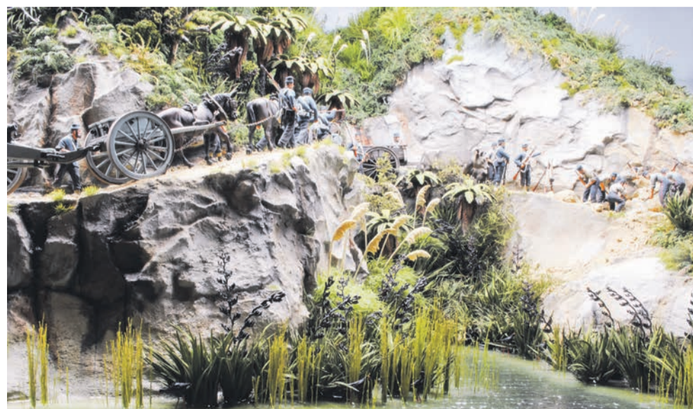
TAWHITI MUSEUM, HAWERA - Share our passion for history Open every Friday, Saturday, Sunday, Monday (including Easter) 10am-4pm www.tawhitimuseum.co.nz

The Taranaki Home & Lifestyle Expo is on this week at TSB Stadium! With over 100 businesses in one place, you can finally bring your building, renovating, interior or landscaping dreams to life.