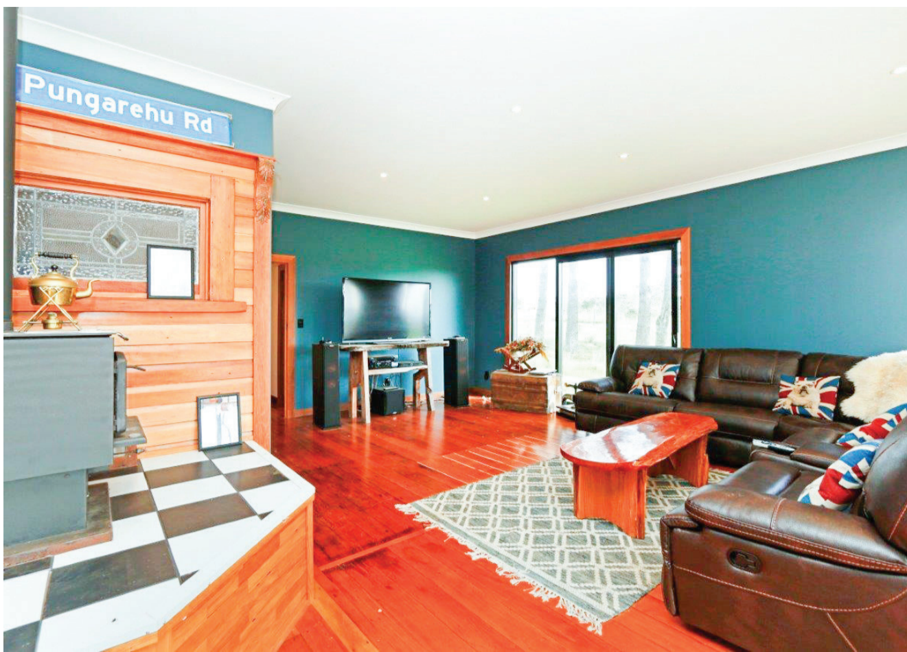
The spacious lounge has a modern woodburner, which is situated on an 'island' above the floor level. The beautiful polished Matai floor extends through the entire home.