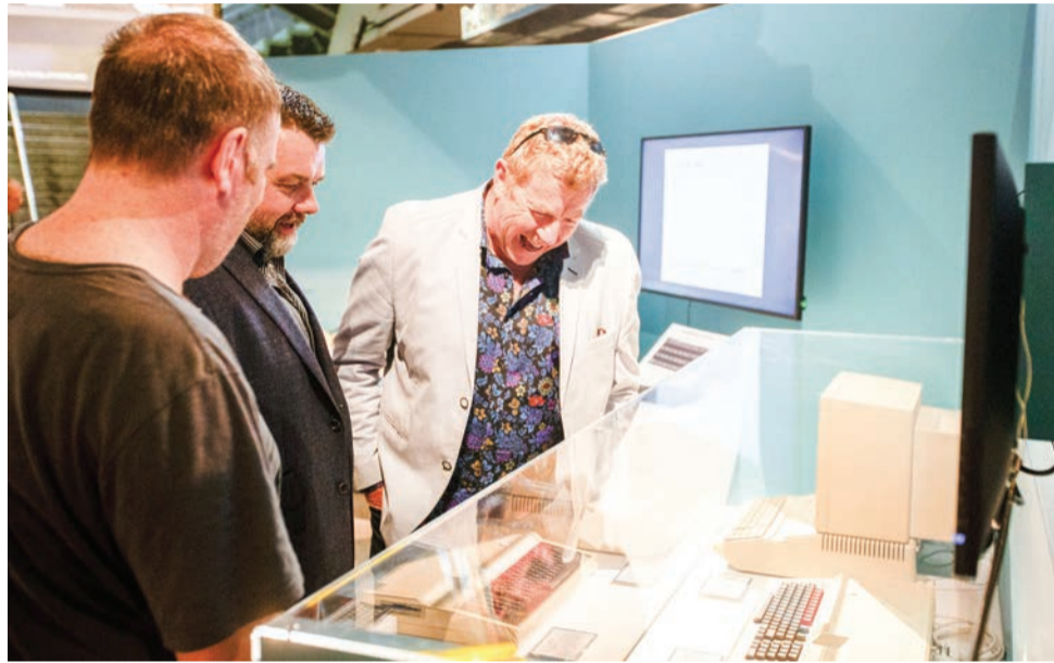
Enjoy some 1980s and 1990s technology nostalgia.